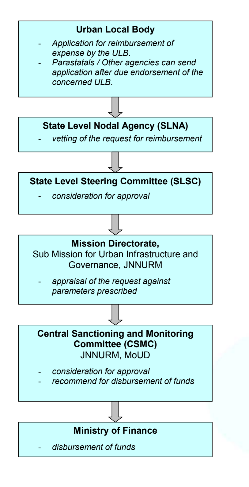
Figure 2: Process of Application, Vetting, Sanction and Reimbursement of expenses incurred in preparation of DPRs